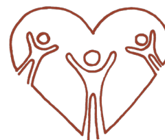
Substance Abuse Prevention Coalition

TRI-TOWN YOUTH SERVICES CHESTER • DEEP RIVER • ESSEX